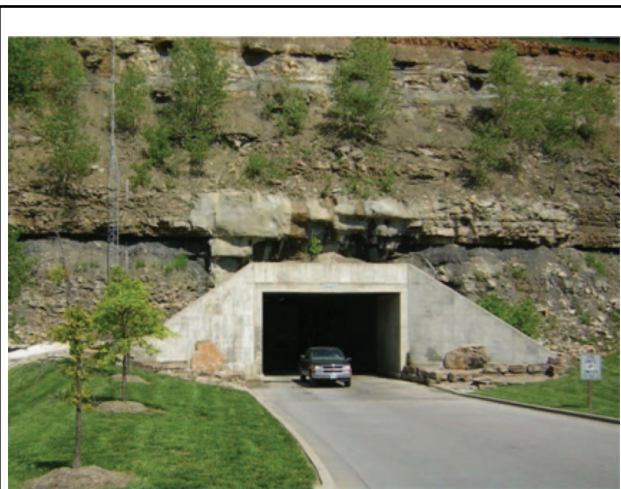
FIGURE 5. The entrance to the Lenexa, Kansas, Federal Records Center. (Color figure available online.)

we selected only Illinois reels for data recovery, including Cook County and all of Illinois's quasi reels. The weights will be adjusted to correct the remaining discrepancies, all of which are minor.